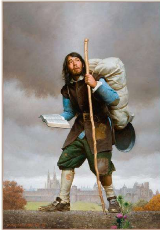
Christian looks for a way of escape outside the City of Destruction.

Sunday 31 st August & 7 th September 2025 Eleventh & Twelfth Sunday after Trinity